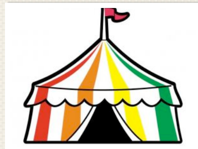
THE CARNIVAL OF MUSIC